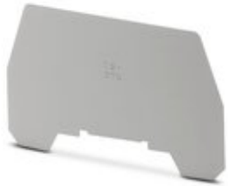
Partition plate, length: 72 mm, width: 0.8 mm, color: gray

Please be informed that the data shown in this PDF Document is generated from our Online Catalog. Please find the complete data in the user's documentation. Our General Terms of Use for Downloads are valid ( http://phoenixcontact.com/download )